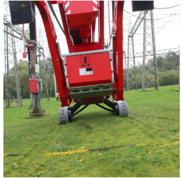
Height- and width adjustable crawler tracks for driving on slopes