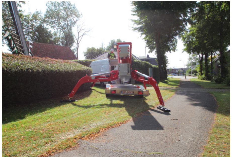
Three different set up positions: Both side wide, both side narrow, one side narrow