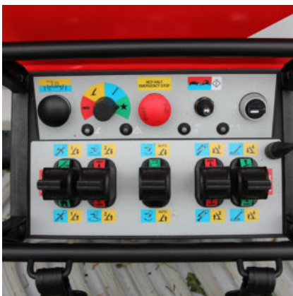
User-friendly remote control with colour coded functions